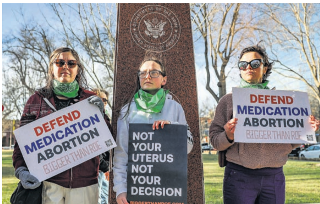
Three members of the Women's March group protest in support of access to abortion medication outside the Federal Courthouse on Wednesday, March 15, 2023 in Amarillo, Texas.

During his confirmation hearings, Kacsmaryk told lawmakers it would be "in-